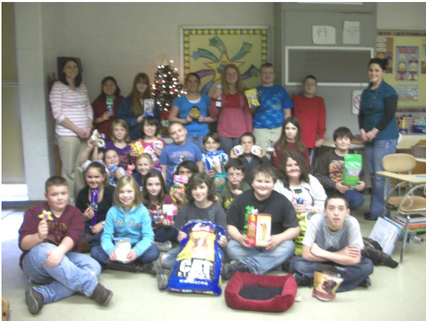
Nickelsville Elementary students & teachers show off their Christmas gifts for SCHS.